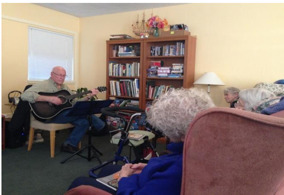
An entertaining afternoon in the Lounge