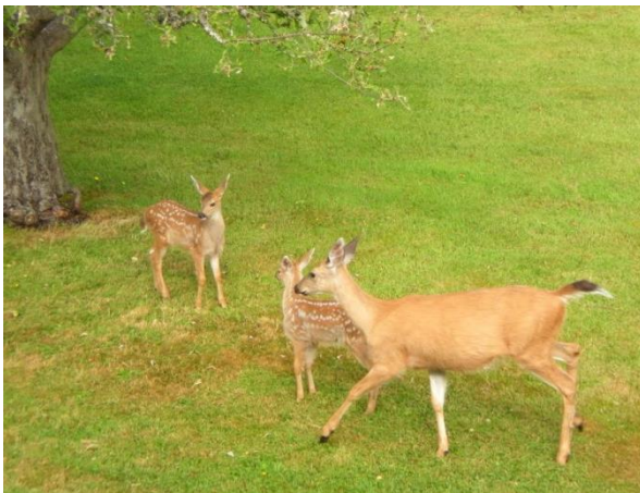
Our lovely deer family frolicking on the lawn